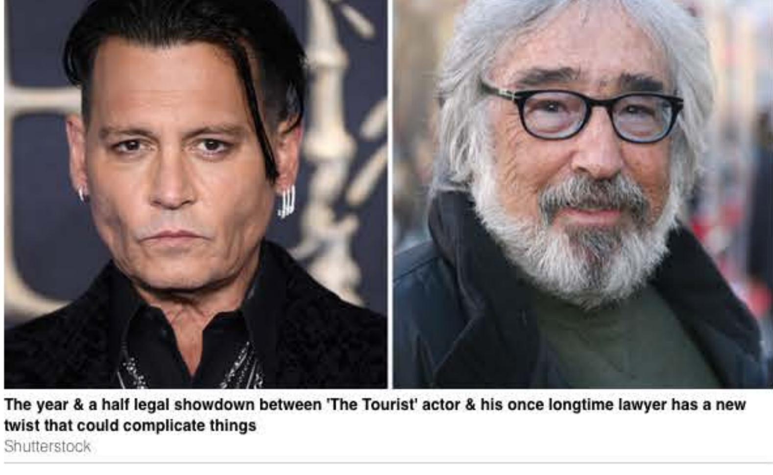
The year & a half legal showdown between 'The Tourist' actor & his once longtime lawyer has a new twist that could complicate things