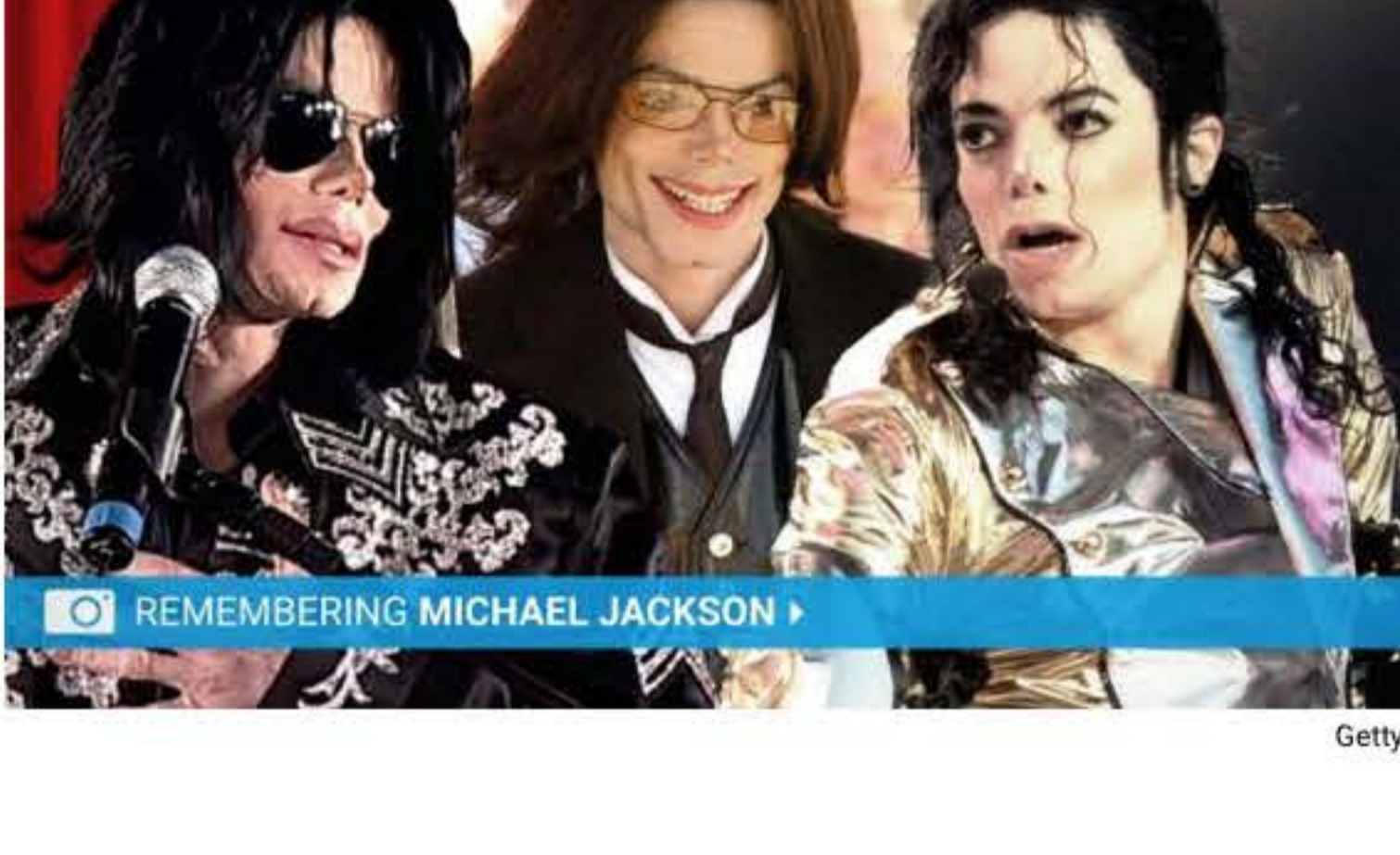
REMEMBERING MICHAEL JACKSON