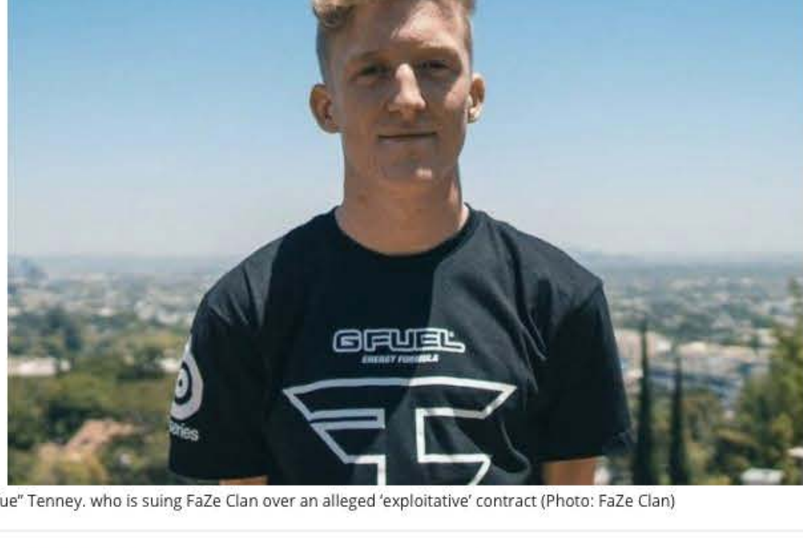
Turner "Tfue" Tenney, who is suing FaZe Clan over an alleged 'exploitative' contract

"These gamers are artists, entertainers and content creators — they perform, they act, they direct"