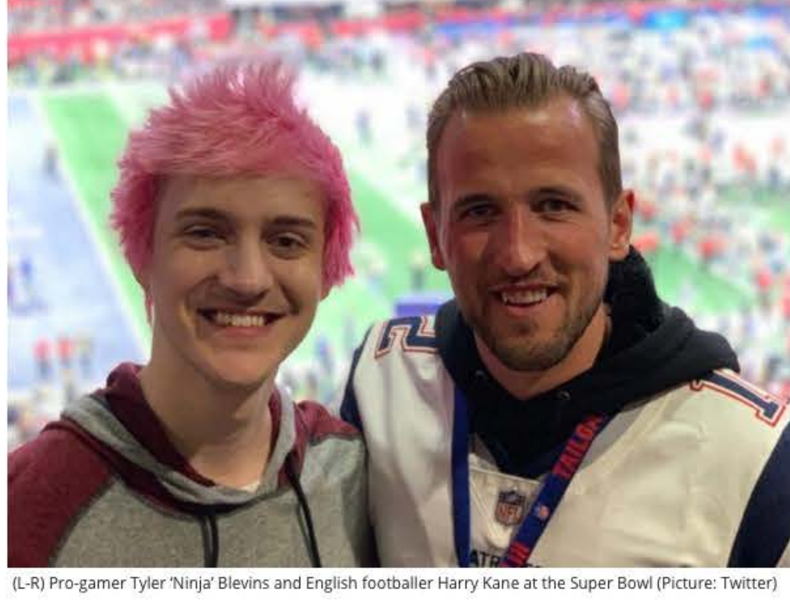
(L-R) Pro-gamer Tyler 'Ninja' Blevins and English footballer Harry Kane at the Super Bowl

Those terms have caused some raised eyebrows in the gaming community, with top streaming stars like Tyler "Ninja" Blevins calling the 80 per cent figure "insane" in his own videos.