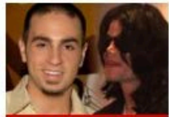
Michael Jackson – NEW CHILD MOLESTATION CLAIM By Wade Robson