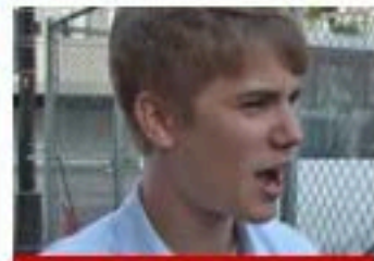
Justin Bieber – Cops Recommend Prosecution to D.A.