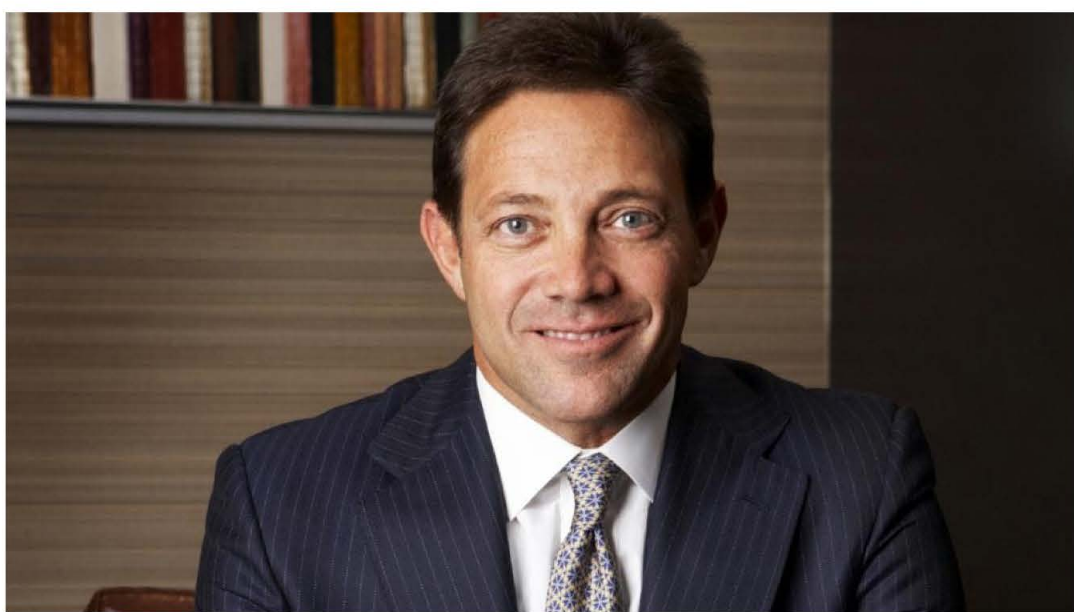
Jordan Belfort, the real Wolf of Wall Street