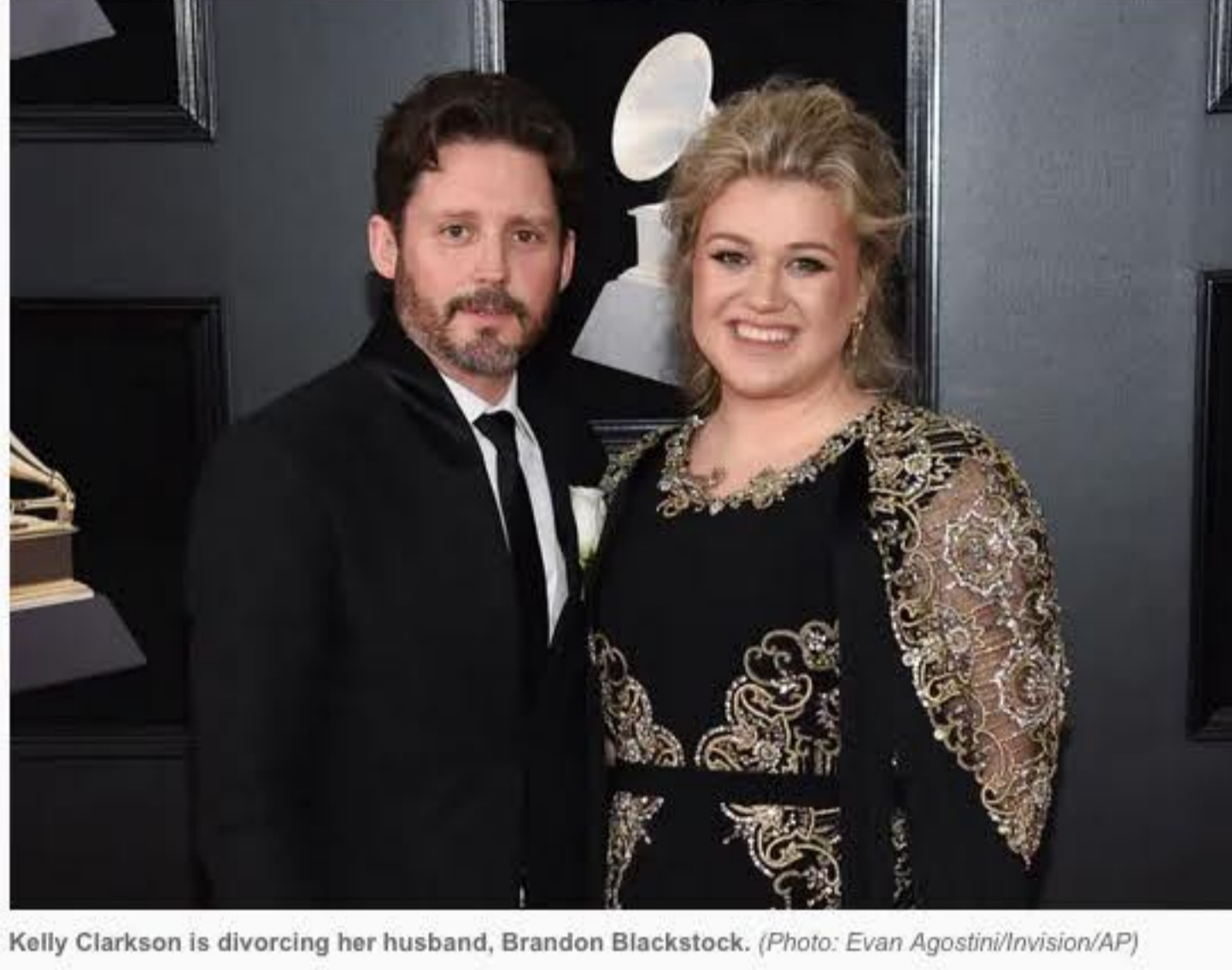
Kelly Clarkson is divorcing her husband, Brandon Blackstock.

Clarkson wants the labor commissioner to get to the bottom of this by demanding a "full and complete accounting" of all the money Clarkson has paid the Blackstocks and Starstruck for services since 2007, and pay it back to her. And she wants a hearing on her complaint.