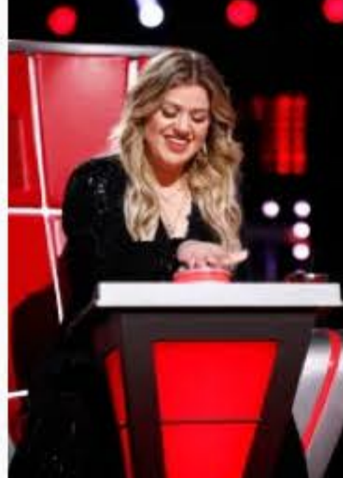
Kelly Clarkson on "The Voice."