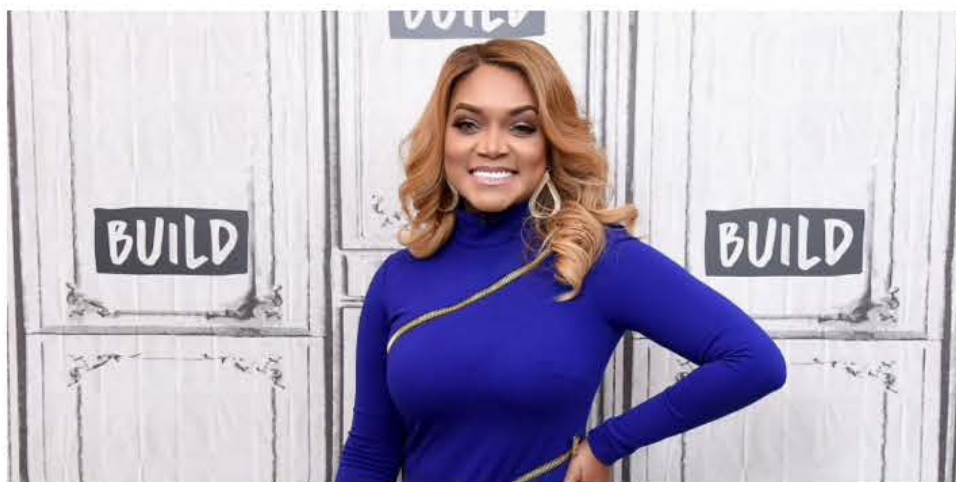
Mariah Huq @ AOL BUILD series

She also noted she wasn't allowed to return for the show's eighth season that she created. She believes the network would have never dreamed of if she wasn't Black.